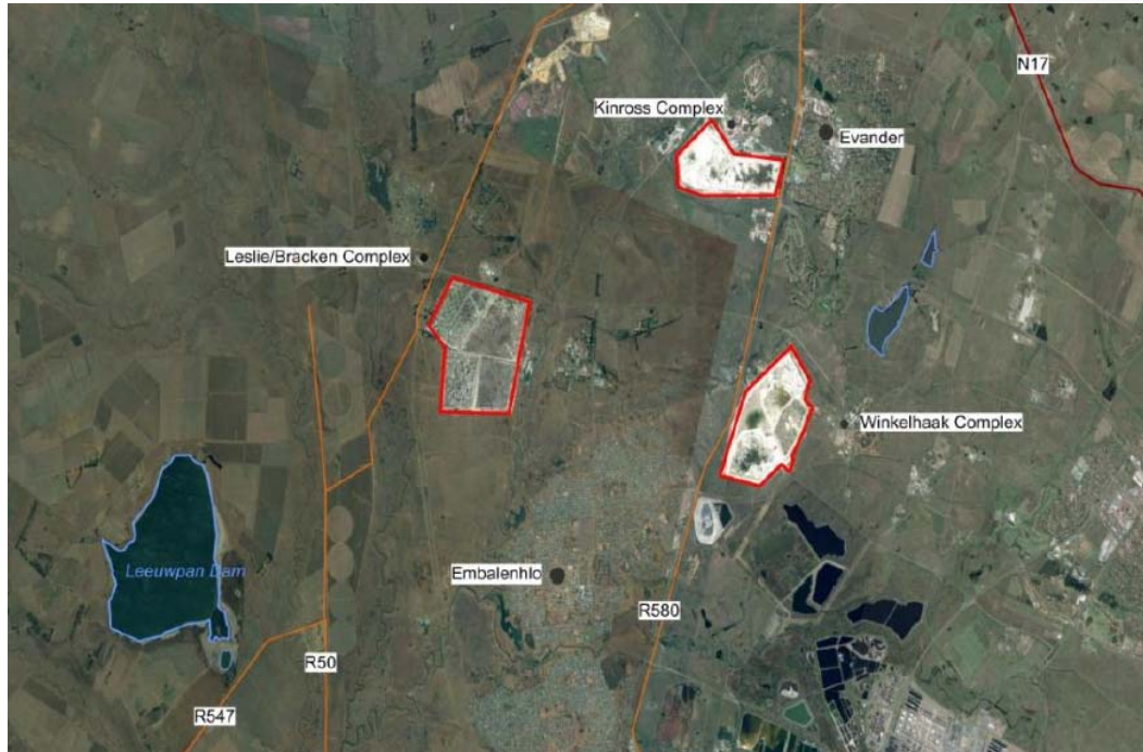
Figure 1.2: Kinross, Leslie and Winkelhaak TSF Location