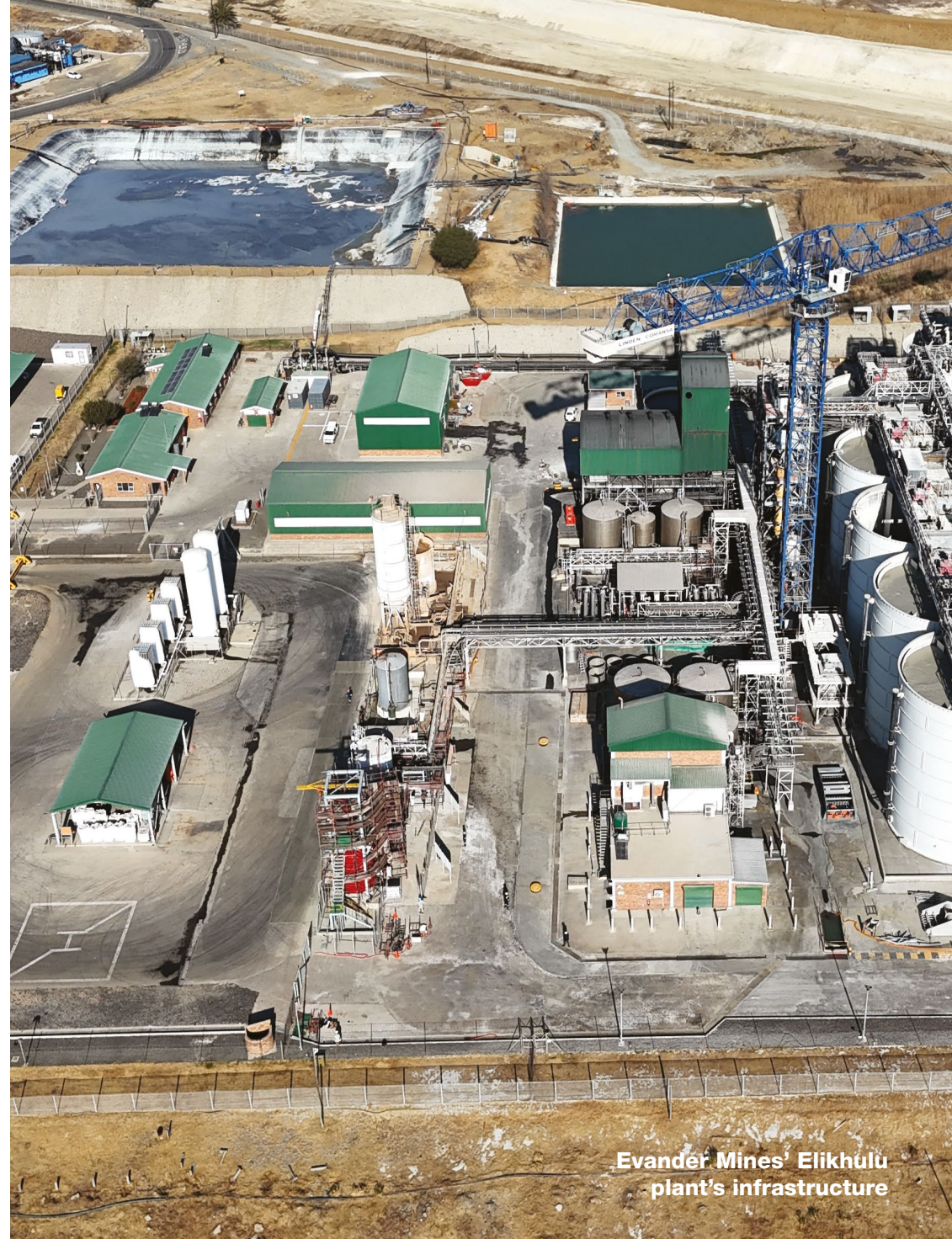
Evander Mines' Elikhulu plant's infrastructure

We welcome any feedback stakeholders may have on our reports. Please send any feedback to info@paf.co.za .