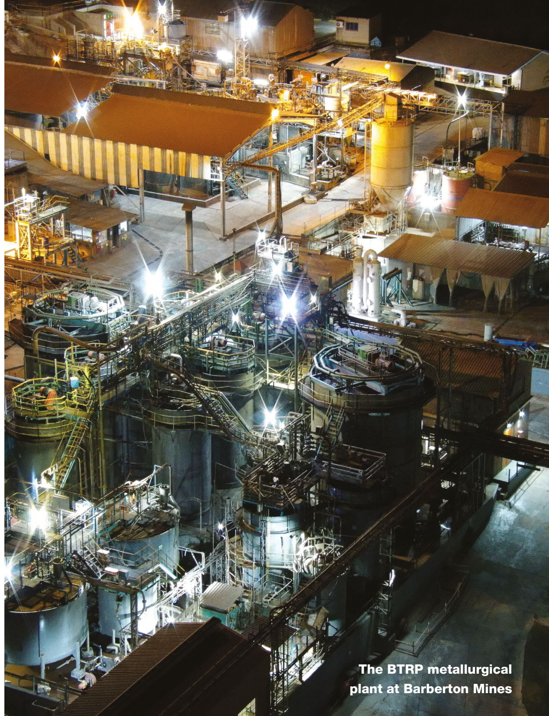
The BTRP metallurgical plant at Barberton Mines