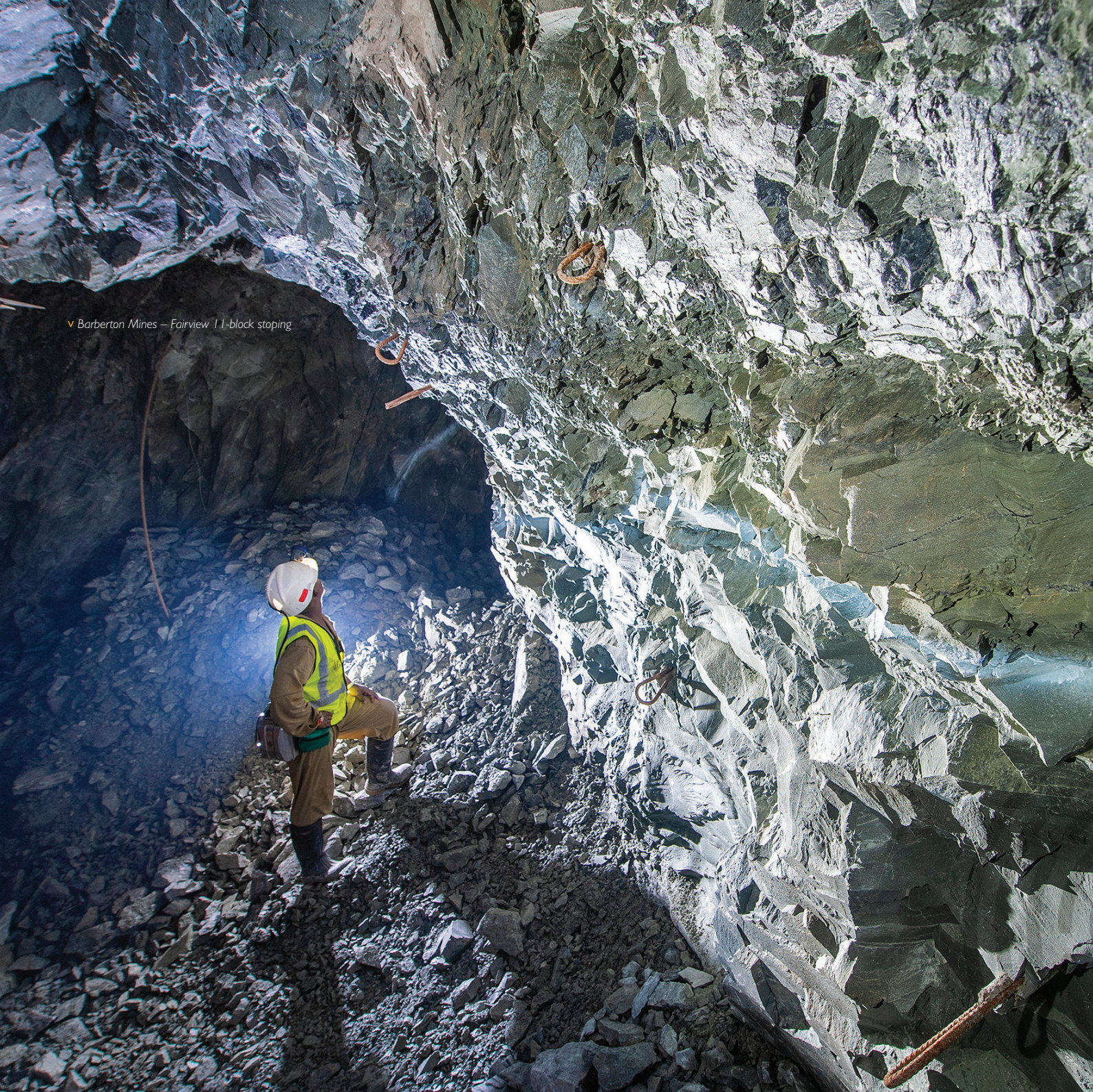
▼ Barberton Mines – Fairview I 1-block stoping